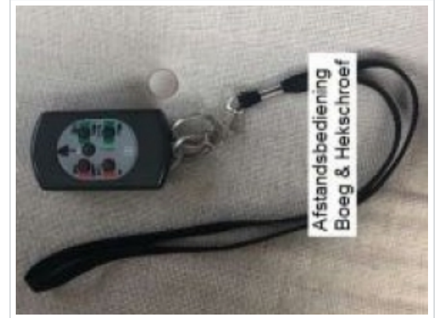
Afstandsbediening Boeg & Hekschroef