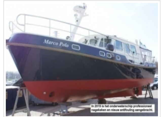
In 2019 is het onderwaterschip professioneel nagekeken en nieuw afdichting aangebracht.