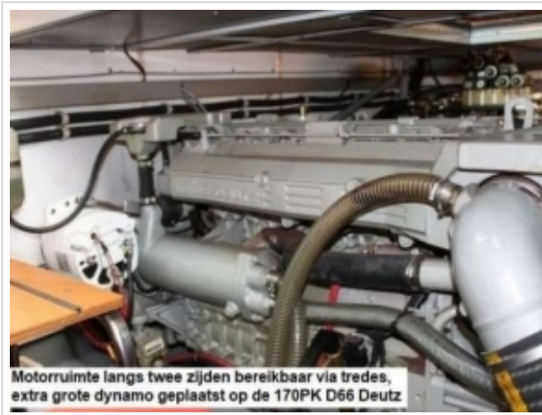
Motorruimte langs twee zijden bereikbaar via tredes, extra grote dynamo geplaatst op de 170PK D66 Deutz