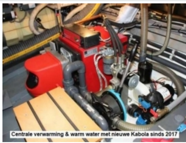
Centrale verwarming & warm water met nieuwe Kabola sinds 2017