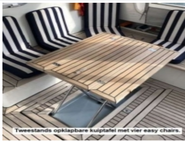
Tweestands opklapbare kuip tafel met vier easy chairs.