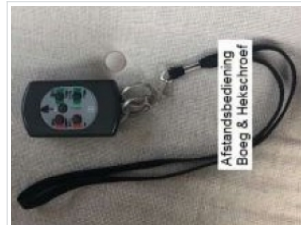
Afstandsbediening Boeg & Hekschroef