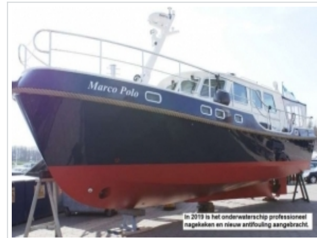
In 2019 is het onderwaterschip professioneel nagekeken en nieuw anfitouwing aangebracht.