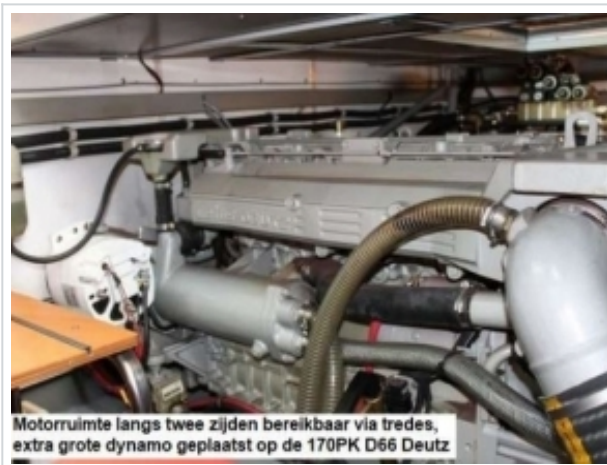
Motorruimte langs twee zijden bereikbaar via tredes, extra grote dynamo geplaatst op de 170PK D66 Deutz