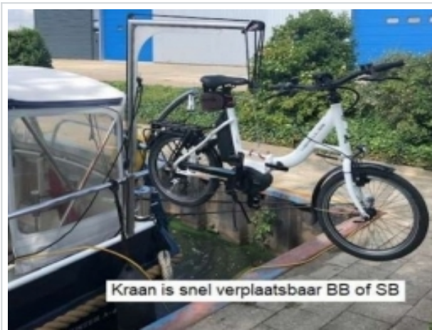
Kraan is snel verplaatsbaar BB of SB