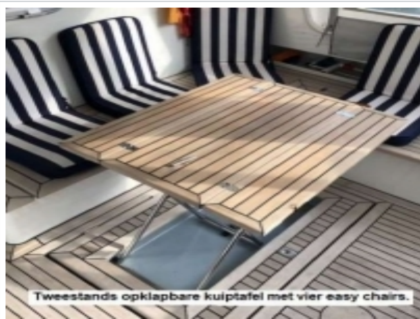
Tweestands opklapbare kuip tafel met vier easy chairs.