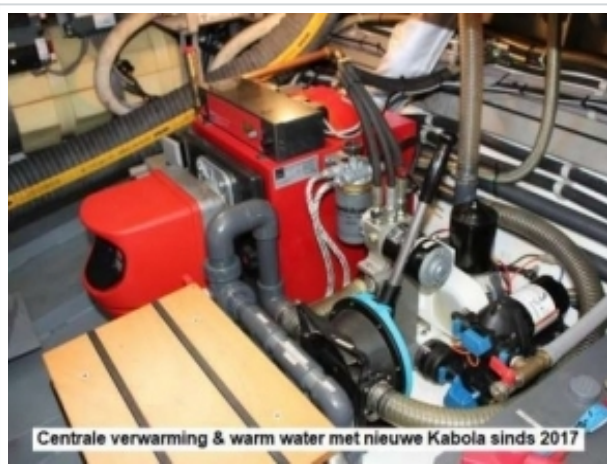
Centrale verwarming & warm water met nieuwe Kabola sinds 2017